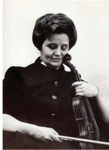
Miss Dorothy DeLay (1917–2002)