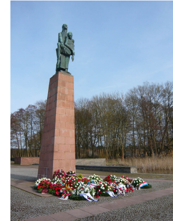
"Die Tragende" or The Burdened Woman by Will Lammert