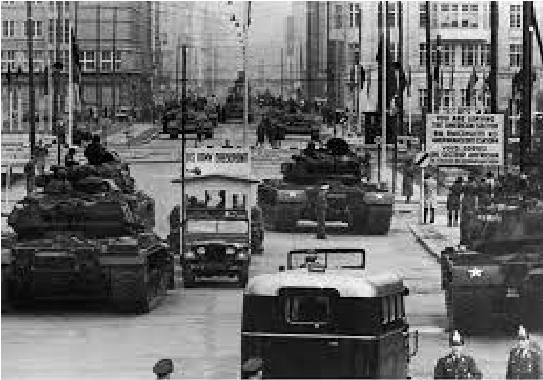
Checkpoint Charlie on 27 October 1961